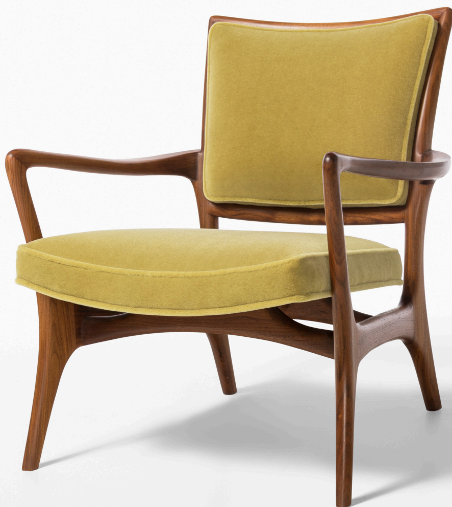
Sculpted Pull Up Chair Model - 175C | Designed 1950